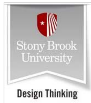
A screen shot of a badge offered by Stony Brook University in Design Thinking ( http://www.stonybrook.edu/commcms/spd/badges/catalog.php ).

A number of SUNY campuses award badges for student participation in extra-curricular activities or to recognize meritorious achievement. The Task Force recommends that campuses be careful to differentiate between badges that represent completion of learning standards (the focus of this report) and those that reflect service.