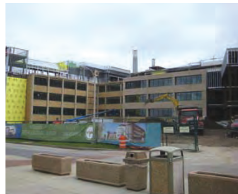
The Village (Residence Hall) - 348 Beds SUNY Oswego