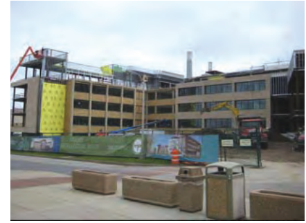
Renovations at Science Engineering and Technology SUNY Oswego