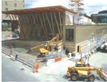
Gateway Building College of Environmental Science and Forestry