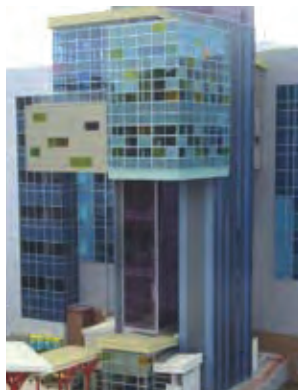
Vertical Expansion/ Children's Hospital Upstate Medical University