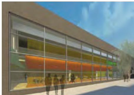
Renovation of Humanities Building Purchase College