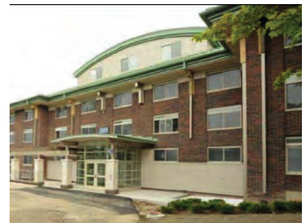
Crispell Hall (Residence Hall) - 222 Beds SUNY New Paltz