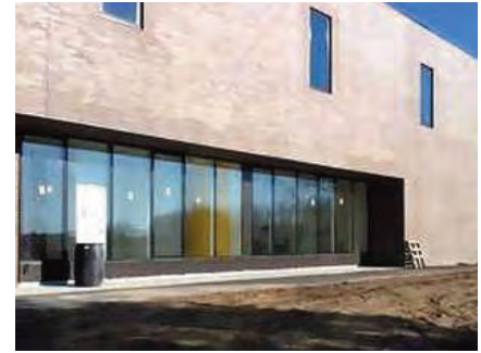
Exterior Renovation – Visual Arts Building Purchase College