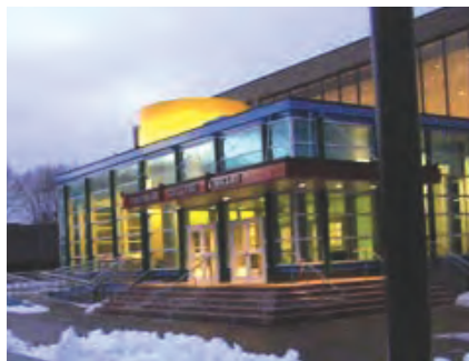
Library Renovation Purchase College