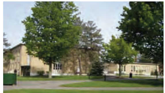
Renovate Charlton Hall Morrisville State College