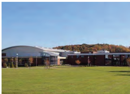
Jorgensen Center Rehab Mohawk Valley Community College