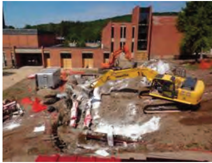
Rehabilitation of Fitzelle Hall College at Oneonta