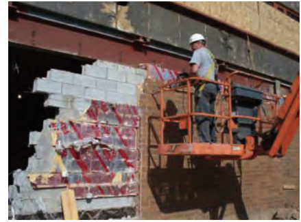
Campus Center Renovation SUNYIT