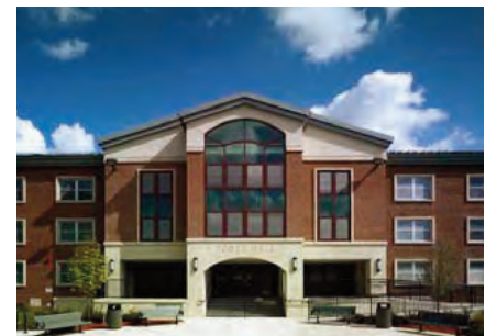
Rehabilitation of Tobey Hall (Residence Hall) - 252 Beds College at Oneonta