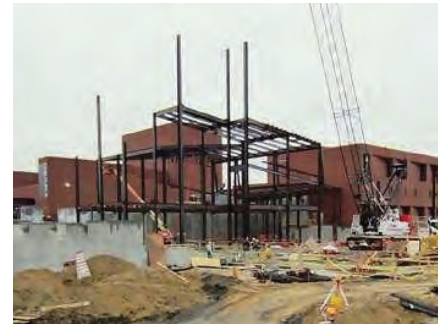
Performing Arts Center SUNY Potsdam