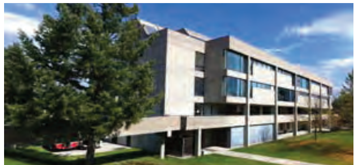
Renovate Beaumont Hall SUNY Plattsburgh