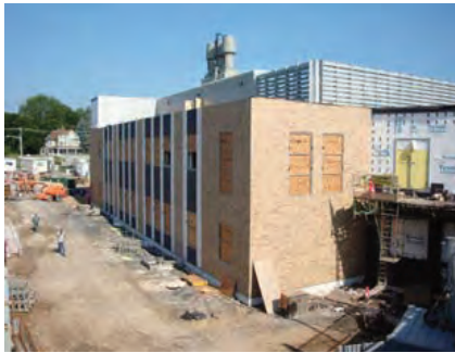
Rehabilitation of Hudson Hall SUNY Plattsburgh