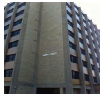
Hood Residence Hall Rehabilitation - 249 Beds SUNY Plattsburgh