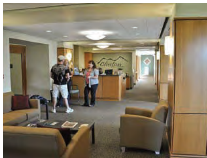
Student Support Services Clinton Community College