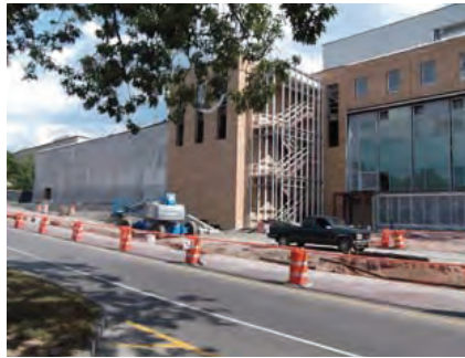
Rehabilitate Stocking Hall NYS College of Agriculture & Life Sciences at Cornell University