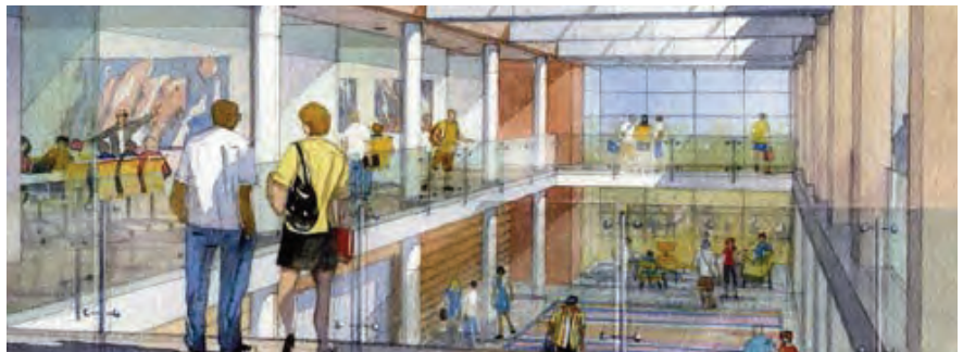
College of Veterinary Medicine College of Veterinary Medicine at Cornell University