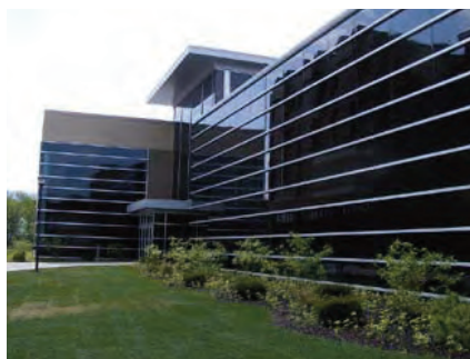
Farrell Hall SUNY Delhi