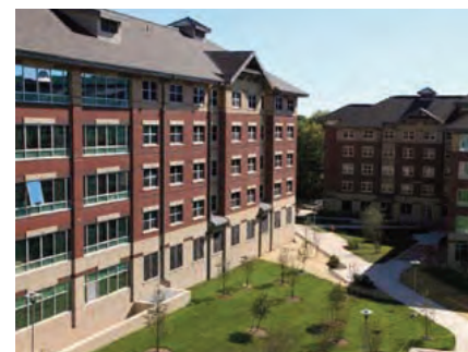
East Campus Housing - 900 Beds SUNY Binghamton