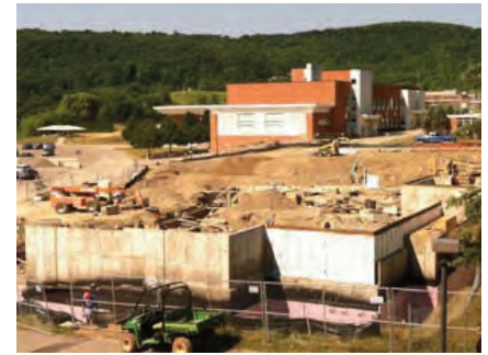
Science Technology Center Broome Community College