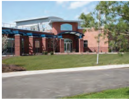
Science Center Jamestown Community College