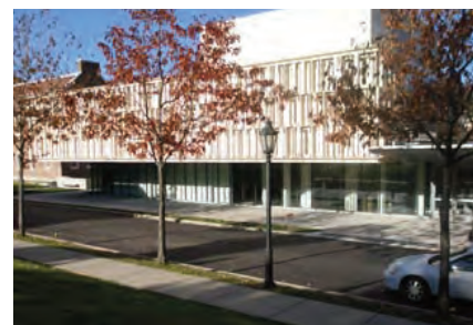
Expansion of the School of Arts & Design NYS College of Ceramics at Alfred University