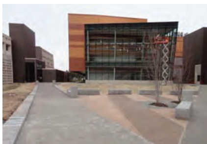
New Engineering Building University at Buffalo