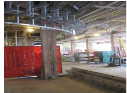
Red Jacket Quad - Residence - 543 Beds University at Buffalo