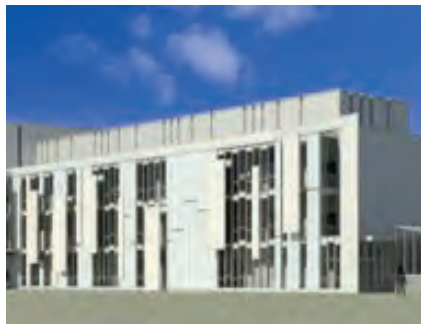
Renovate Science Building - PHII Buffalo State College